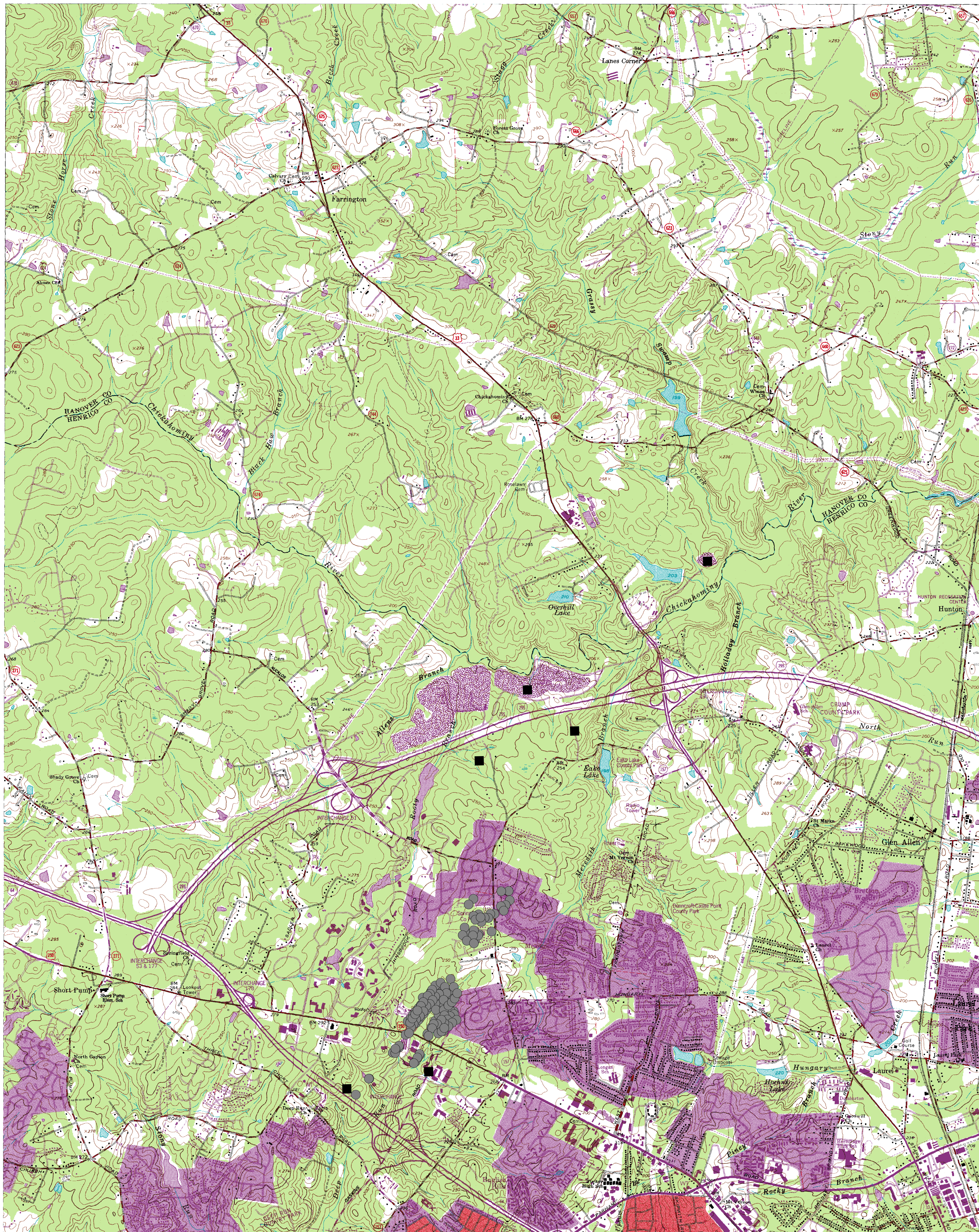
USGS 7.5' Topographic Quadrangle